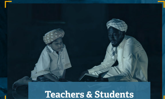
Teachers & Students of Entire Seminaries