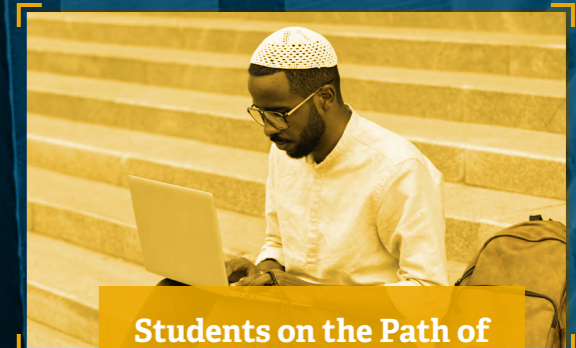
Students on the Path of Becoming Scholars