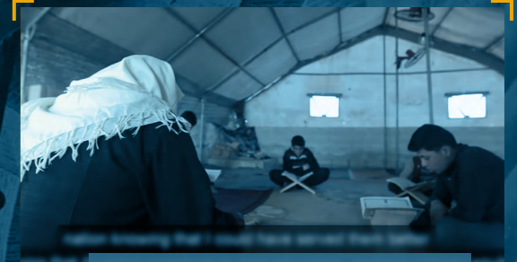
Scholars in War-Torn Countries