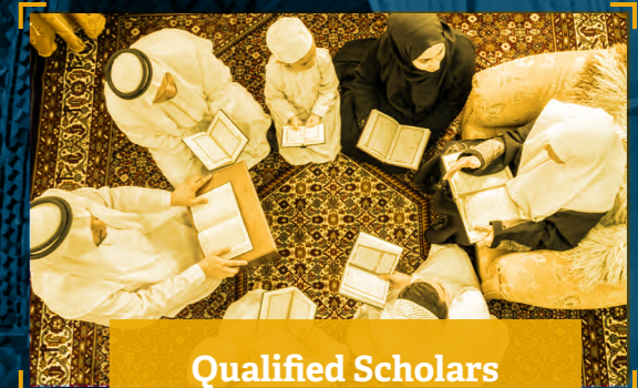
Qualified Scholars (Male & Female)